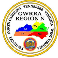
Region N GWRRRA NC – C2, Smithfield, NC