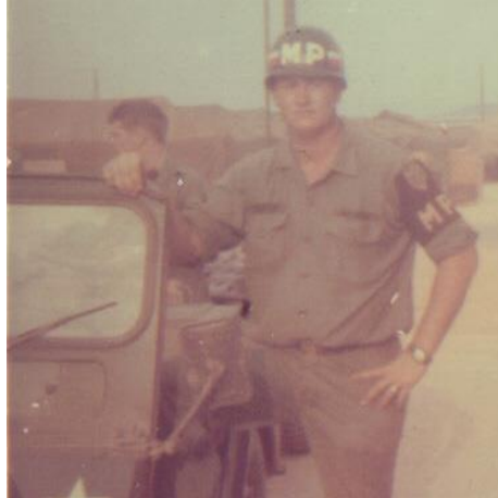
My very own Hero

As I write this I am preparing to leave for Haiti along with 11 others from our church to help at the Mission of Hope again this year. The people there as well as those of us going will really appreciate all your prayers and good wishes during this week and always.