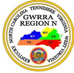
Region N GWRRRA NC – C2, Smithfield, NC