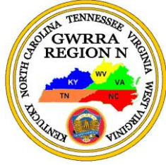
Region N GWRRRA NC – C2, Smithfield, NC