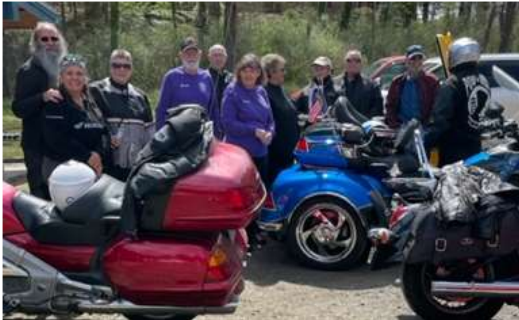
Friends for Fun, Safety and Knowledge!