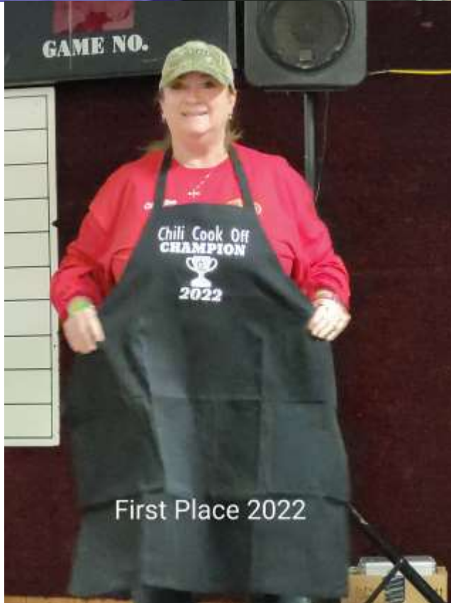
First Place 2022