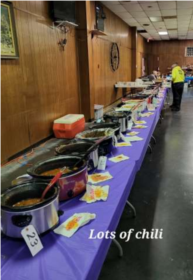
Lots of chili