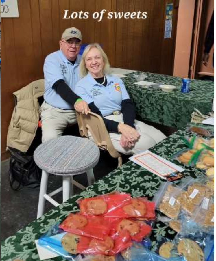
Lots of sweets